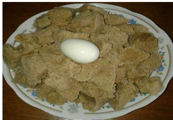
Figure 3. Nitak

Nitak is a typical Simalungun food where the method of making it is through the process of pounding flour in a "mortar" (Fig 3). With a combination of typical spices, the flour continues to be pounded until it blends into nitak. Nitak is usually combined with Dayok binatur to be served at an event, the taste of nitak itself is sweet and also has a thick pepper flavor that makes our tongues sway to eat it. Eating nitak must also be careful when talking, because it will make it difficult for our tongue to make a sound.