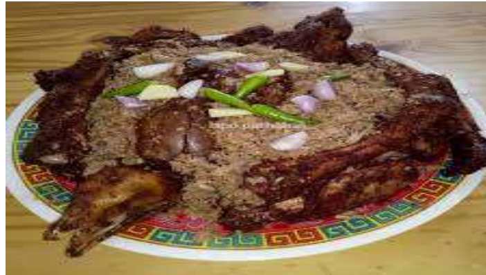
Figure 2. Dayok Nabinatur