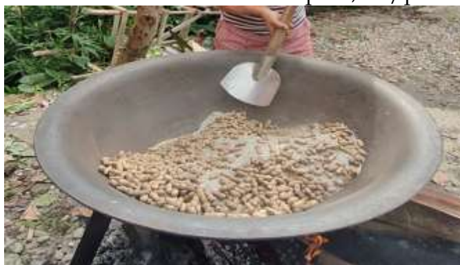
Figure 7. Soak Beans

For peanut eaters in the Lake Toba area, you may be familiar with Sihobuk peanuts from Tarutung, North Tapanuli Regency. Saok peanuts are a snack made in Simalungun Regency, precisely from the Tiga Rihit Tourism Village, Girsang Sipangan Bolon, or Parapat District. The ingredients for Saok peanuts are peanuts (Figure 7), which are taken from the fields of residents in the Lake Toba area and then roasted in a large cauldron using sand and a wood-burning tool. While Sihobuk Beans are roasted using river sand, Saok Beans are roasted using lake sand and that is what makes these beans tasty and crunchy on the tongue. The brand is Sasagun Saok Nuts, packaged in plastic of various sizes and sold for Rp. 15,000/pack.