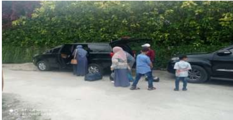
Figure 1. Available Parking Lots

The condition of the parking lot in the Tiga Rihit colorful village tourism village can only fit 2 cars, the parking lot is in front of a resident's house and is not the land of the residents of Tiga Rihit. As seen in the Figure 1.