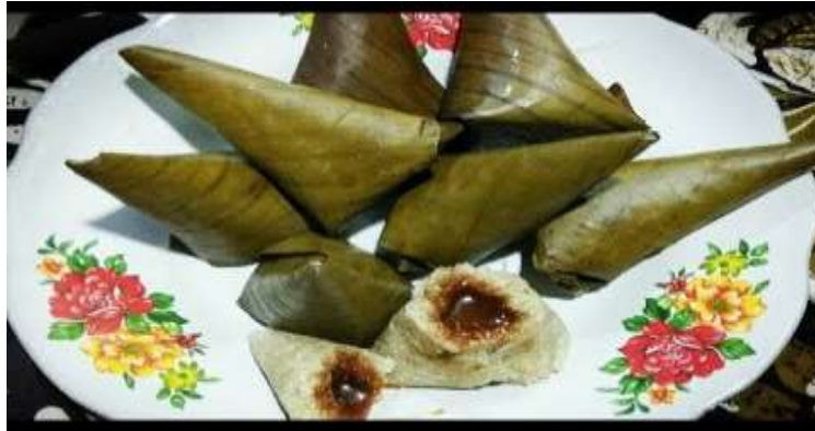
Figure 4. Lappet

Snacks are made from rice flour, the short way to cook this lapet is rice flour along with other spices wrapped in banana leaves, then steamed usually the lapet in the middle is made with brown sugar to make it delicious. A delicious lapet is where the coconut milk and sweetness can be balanced (Figure 4).