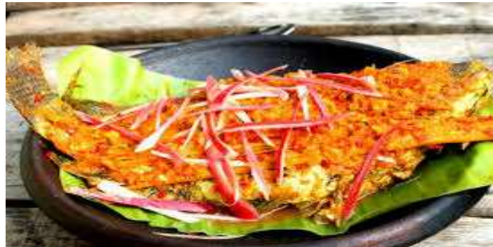
Figure 5. Arsik

Usually, the food that is cooked into 'Nan i Arsik' is fish. But lately, many Simalungun people also make meat into Arsik food. Arsik has been found in many typical Batak restaurants around us, which makes this Na I Arsik food delicious, namely Ittir-ittir. The name is not Nan i Arsik if there is no Ittir-ittir flavor. your tongue will sway by eating Na I Arsik thanks to this typical Batak spice (Figure 5).