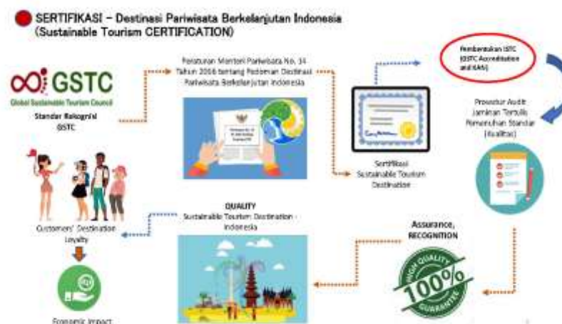
Figure 1. Research Conceptual Framework

Utilizing information from the Scopus academic database, this study employs a bibliometric approach to examine the growth of sustainable tourism destinations in Indonesia. To find the primary concepts developed in the literature, methods include author collaboration, citation patterns, quantitative analysis of the number of publications, and co-word analysis in order to identify key concepts evolving in the academic literature. The researcher employed the VOSviewer bibliometric tool to analyze the research data and describe the relationship between the articles and the research studied. The data was gathered using keywords related to destinations, tourism, gstc, and criteria (Judijanto & Latif, 2025).